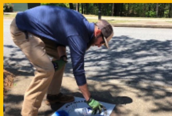
Stormdrain Marking Event with City of Holly Springs