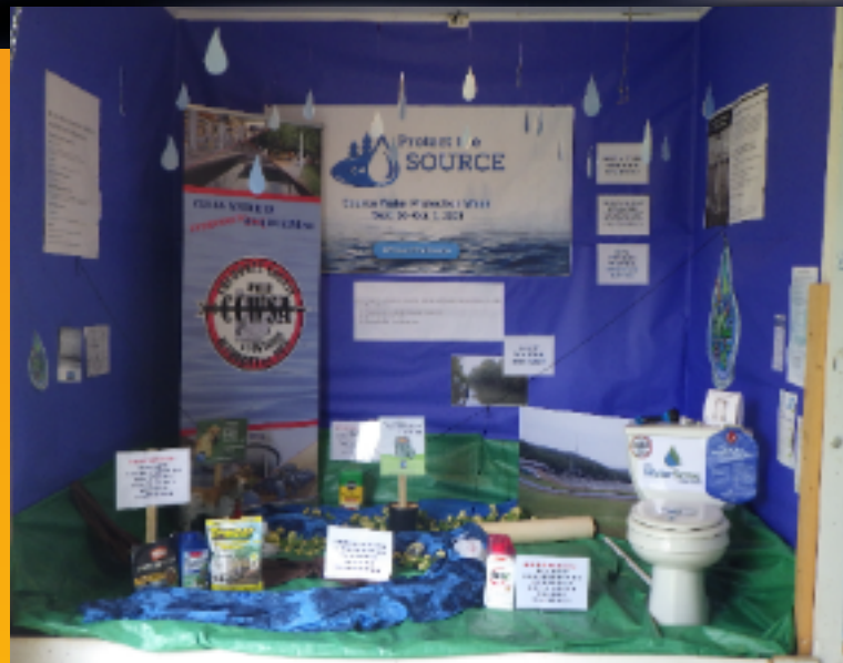
Cherokee County Fair Booth "Protect the Source"