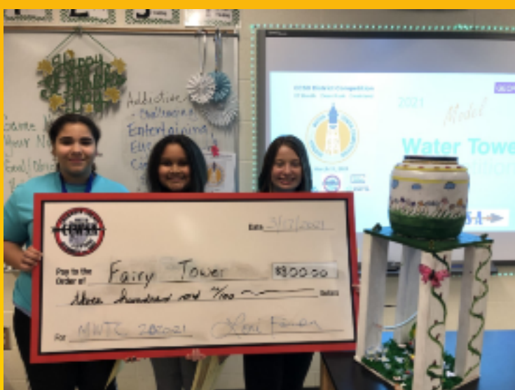
Model Water Tower Competition winners